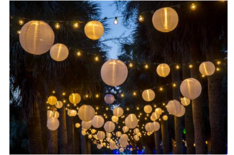
Incorporate lighting historically displayed in the community