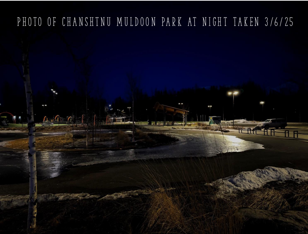
PHOTO OF CHANSHTNU MULDOON PARK AT NIGHT TAKEN 3/6/25