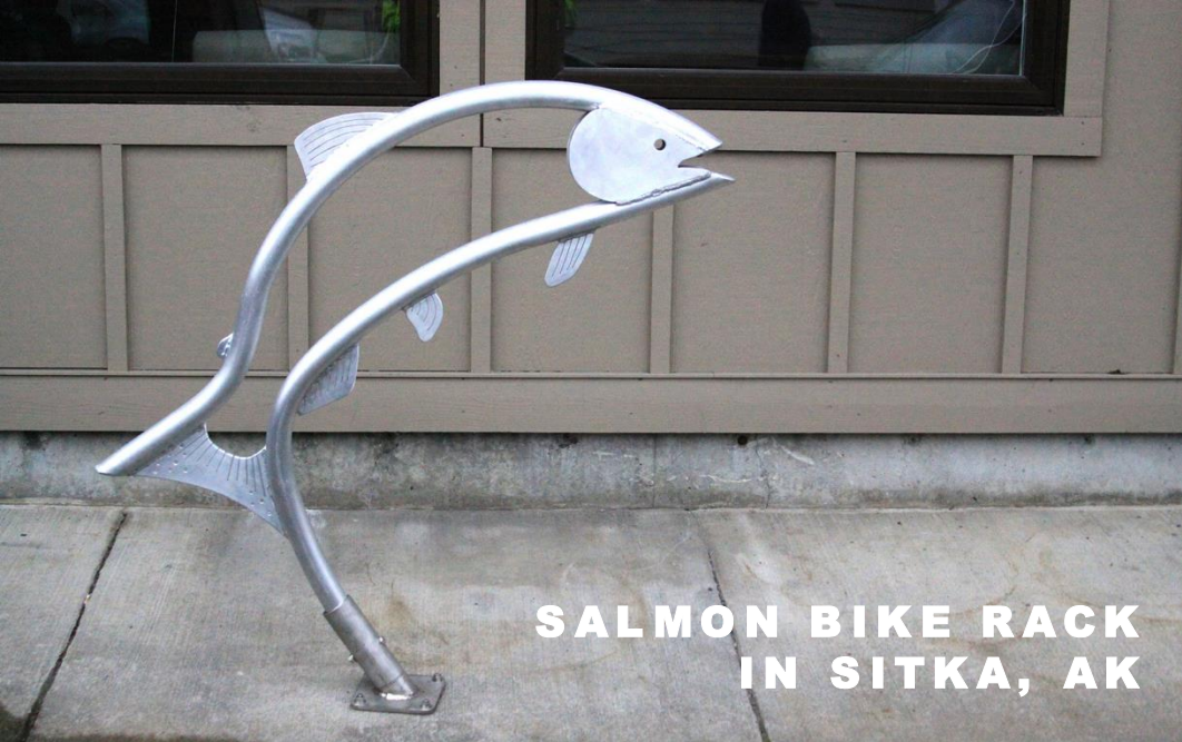
SALMON BIKE RACK IN SITKA, AK

The intersection of Muldoon and Debarr is a transportation hub for People Mover - many people walk or bike to the bus stop, and utilization would likely increase if infrastructure was improved to support non-motorized transit usage. The intersection is also a center for grocery shopping with both Fred Meyer's and Walmart Supercenter.